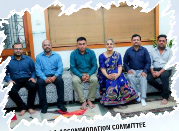
TRAVEL & ACCOMMODATION COMMITTEE