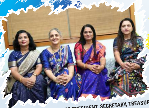
CORE TEAM PRESIDENT, VICE-PRESIDENT, SECRETARY, TREASURE